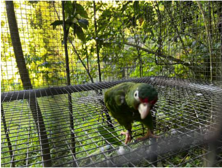
Above: Up close and personal with the Endangered Puerto Rican Parrot.