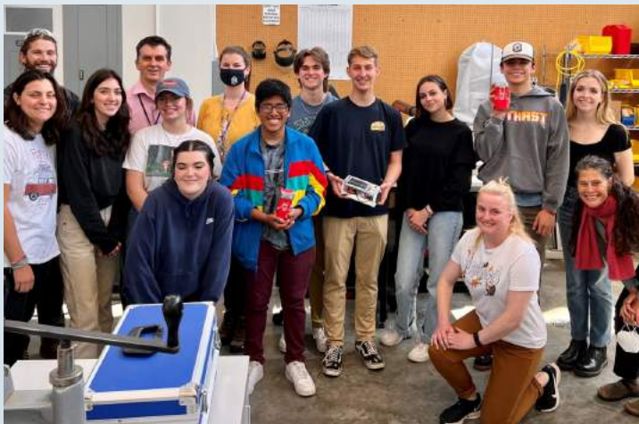
Above: YAI team at the Hatfield iLab working on their prototypes.

Youth as Inventors - The Youth as Inventors (YAI) 4-week pilot program took place from May 23 rd - June 17 th . Students from Newport High School finished the program with 2 days at the HMSC iLab, prototyping and testing their final inventions which focused on stopping marine debris and improving earthquake and tsunami notification systems. Check out some photos from the YAI program: