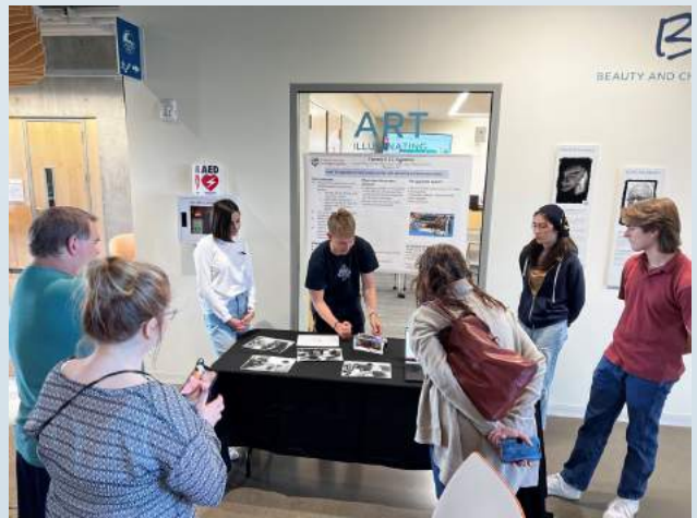
Above: YAI students presenting their project at Hatfield.