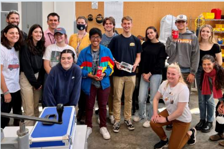
Above: YAI team at the Hatfield iLab working on their prototypes.

Youth as Inventors - The Youth as Inventors (YAI) 4-week pilot program took place from May 23 rd - June 17 th . Students from Newport High School finished the program with 2 days at the HMSC iLab, prototyping and testing their final inventions which focused on stopping marine debris and improving earthquake and tsunami notification systems. Check out some photos from the YAI program: