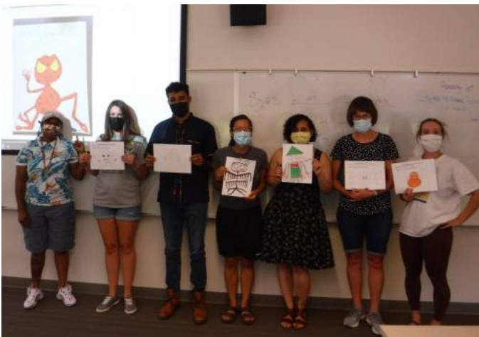
Photo: First-Year SMILE Teacher Orientation from the 2021 Summer Teacher Workshop.

To Finley: turn LEFT onto 15th St; turn RIGHT on Washington (just this side of the train tracks) then turn LEFT on 17 th Street (across from the baseball stadium). Then turn RIGHT into the parking lot. Finley Hall's address is 2100 SW May Ave., Corvallis, OR 97331. A campus map highlighting important building locations will be provided closer to the workshop.