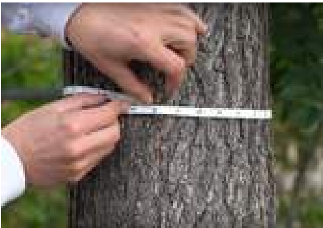
Measuring tree diameter.

Forestry Lesson: We will introduce our new lesson: Forestry Sensors! We will talk about the use of sensors in forestry applications and specifically, the use of sensors to determine the volume of trees growing in the forest. Forest managers call these "forest inventories." We will measure trees with traditional methods and then with new methods, so we can better understand the impact of these new technologies. Then we will have a discussion and feedback session around a hands-on activity we are developing on this topic (to share at the Summer Teacher Workshop, in August).