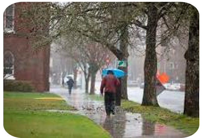
A rainy day at OSU